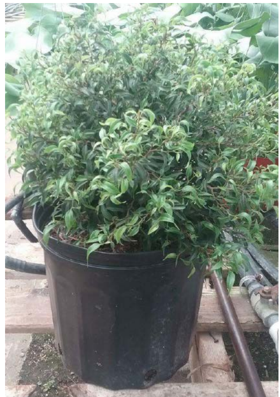
One of the Ficus trees that will be available at the June meeting.