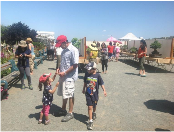
Over 7,000 people visited our 2013 bonsai show