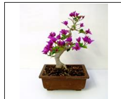
Bougainvillea Bambino TM Baby Mia

The group also looked at samples of Bougainvillea Pink Pixie . 6" container plants 6" to 8" tall and then a couple that were pruned down to 3" in May 2012. Two of these 3" tall plants were potted into small bonsai pots.