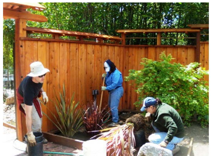
Volunteers at work at the Pavilion